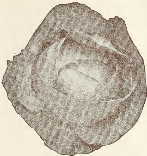
Early Flat Dutch Cabbage.